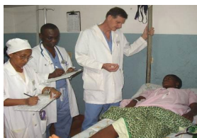
Bedside teaching and evangelism is a vital part of the curriculum.

Few African countries have enough surgeons to care for their poor and middle classes. Every year, countless thousands of Africans suffer and die from physical problems that could be rectified through surgery. Most Africans are unable to receive even the most basic surgical care. This dearth of surgeons in Africa is becoming more acute every year.