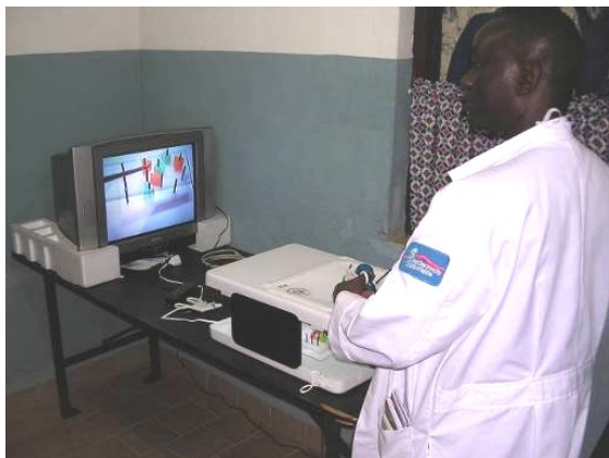
PAACS adapts the latest surgical thinking to the realities of the developing world environment.

1. You can help support an African resident in training. Few African doctors wishing to become surgeons can afford the training without outside support. The PAACS wants to enable every qualified African doctor who wants to serve Jesus Christ through surgery to receive the training he