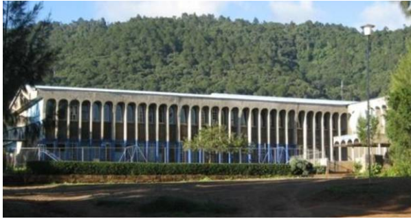
Kijabe Hospital, Kenya

I know this is a tall order, but at this time I am writing to everyone I can think of who's ever held a scalpel to ask if they could come and help out in 2010. Another full-time PAACS surgeon would be the best help of all."