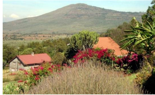
View of Rift Valley from the housing campus

Kijabe Hospital has been certified by COSECSA for five years of training in general surgery. It is the oldest and biggest of the Kenyan mission hospitals, the second busiest surgical hospital in Kenya (over 8,000 cases a year) and is located on the escarpment of the Great Rift Valley, approximately 7500 feet above sea level.